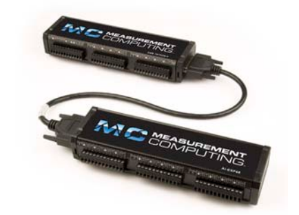
USB-1616HS-2 attached to a AI-EXP48 expansion device by a CA-96A cable