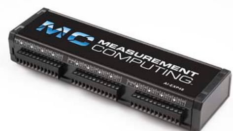
AI-EXP48, analog input expansion device

Note: For OEM and embedded applications, see USB-2500 Series.