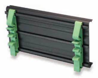
DRM, DIN-rail mounting adapter