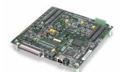
USB-2500 Series, 16-bit/1 MHz USB data acquisition boards