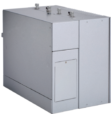
▲ Rear view