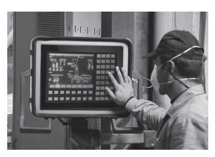
\blacktriangle Ideal for factory automation & self-service kiosk in retail