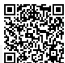
T800-EX 3D demo