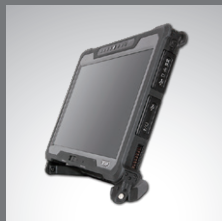
A140 with Multi-Function Hard Handle as Kickstand