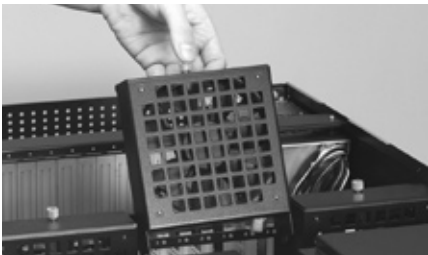
Built-in hot-swap fans