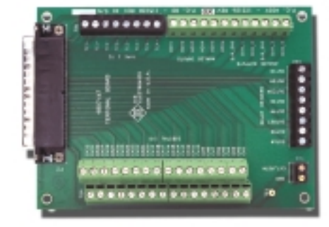
Mating Terminal Board Assembly