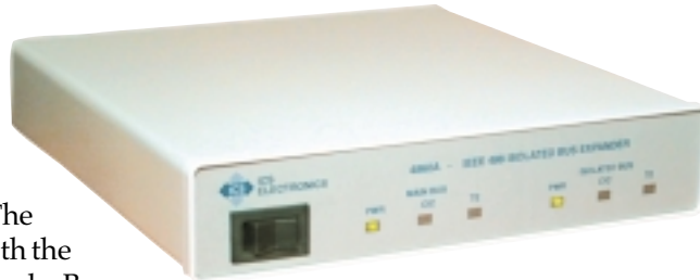
4860A Bus Expander/Isolator

ICS's 4860A GPIB<->GPIB Isolated Bus Expander solves four of the most common problems encountered in GPIB systems - device loading, signal noise, ground loops and cable distance. The new 4860A Expander complies with the IEEE-488.2 Standard and is the only Bus Expander that does not give false responses to the FindListener protocol. The Model 4862A is a lower cost Bus Expander for applications that do not require electrical isolation.