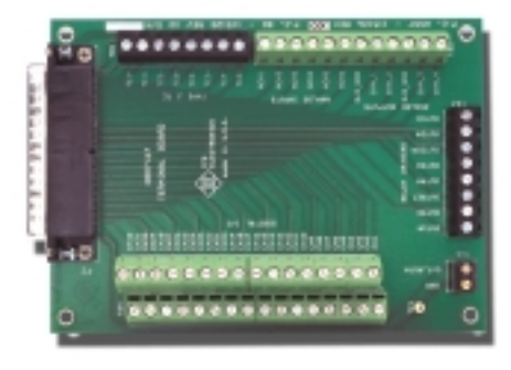
4867/2307 Terminal Board Assembly