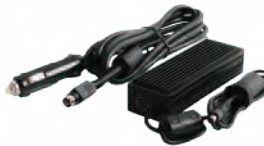
Vehicle Adapter (90Watts, 11-16VDC and 22-32VDC)