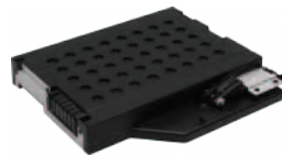
Multimedia Bay 2nd Battery (8700mAh)