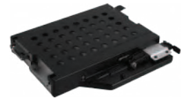
Multimedia Bay 2nd HDD