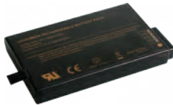
Main Battery (8700mAh)