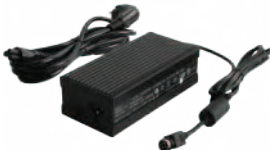
MIL-STD-461F Certified AC Adapter (90W, 100-240VAC)