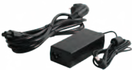
AC Adapter (90Watts, 100-240VAC)